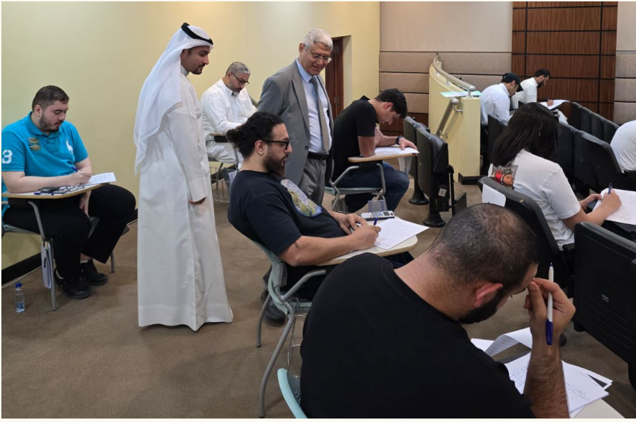
Inspection Tour by the Deans of Academic Programs to Ensure the Smooth Conduct of Exams – Headquarters

The deans of the Faculties of Business and Language Studies conducted an inspection tour at the main campus in Kuwait to ensure the proper conduct of exams, verify compliance with regulations, and confirm that the testing environment meets the university's standards of academic quality and integrity.