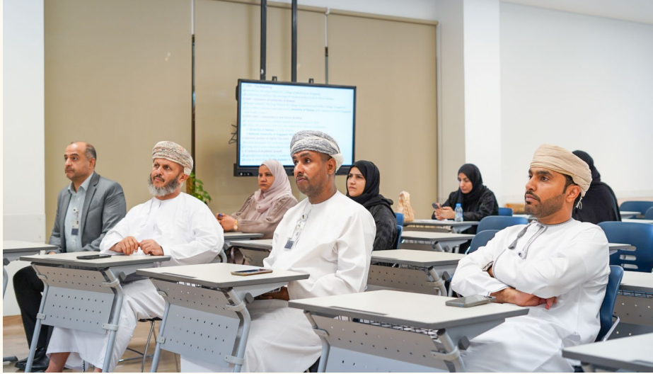
Faculty of Education Welcomes University of Malaya Delegation to Foster International Academic Cooperation – Oman

The Faculty of Education organized an introductory meeting with a delegation from the University of Malaya (UM) to strengthen academic collaboration and exchange expertise. The meeting discussed potential partnership areas, academic programs, and ways to benefit from mutual research and practical experience, supporting the university's goals of international engagement in line with Oman Vision 2040.