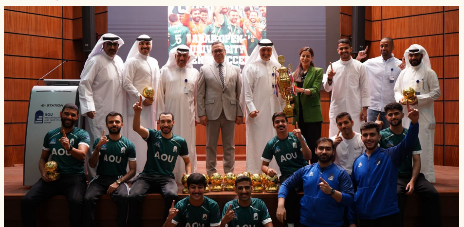
AOU Director Honors Football Team for Winning KIPCO Kuwait 2025 Championship – Kuwait

The Childhood Care Center and Youth Homes in Oman visited the university to explore its innovation and training programs, aiming to enhance cooperation between educational and social institutions. The visit focused on exchanging knowledge about capacity-building initiatives and support services for innovators and youth development.