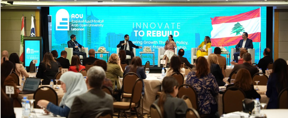
National Conference - Lebanon

As part of its commitment to environmental issues and The Arab Open University - Lebanon held its annual sustainable development, the university sponsored the national conference in Beirut, bringing together leaders 2025 Arab Beekeepers Union Conference under the theme: from various sectors to explore innovative solutions for "Climate Change and Its Impact on the Beekeeping building a more inclusive and resilient economy. The Sector." The conference brought together a distinguished event group of researchers and specialists in southern Lebanon, entrepreneurship, and gender justice. It provided a highlighting the role of universities in linking academic platform for dialogue and collaboration between research to environmental challenges and community- academia, civil society, and the public and private driven solutions.